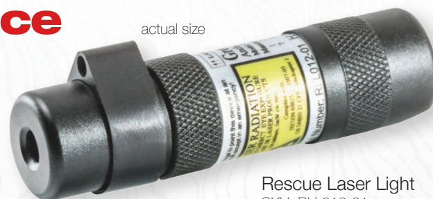
Rescue Laser Light SKU: RLL013-01